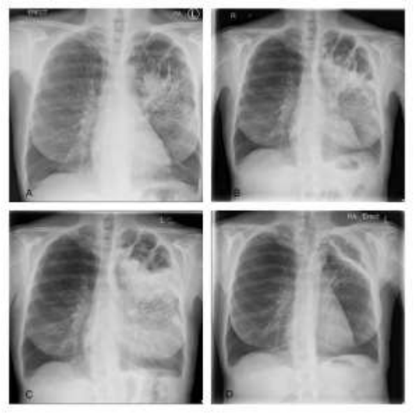
Figure 1. A: Admission CXR demonstrates upper lobe bullae and left peri-hilar consolidation on background of emphysema. B: Day 4 CXR reveals more confluent consolidation and opacification of the bullous change. C: Day 8 CXR demonstrates air fluid level with increasing density of consolidation. D: Repeat CXR 6 weeks after discharge shows near complete resolution of findings with small residual cavity.