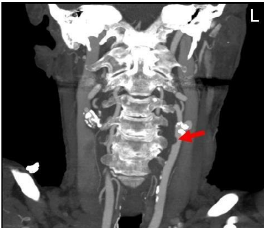
Figure 1. CT angiogram of the neck showing narrowing of the left common carotid artery (red arrow).

A CT angiogram of the neck was performed and demonstrated a focal 50% narrowing of the left common carotid artery (see below) compatible with, but not specific for an acute traumatic carotid dissection.