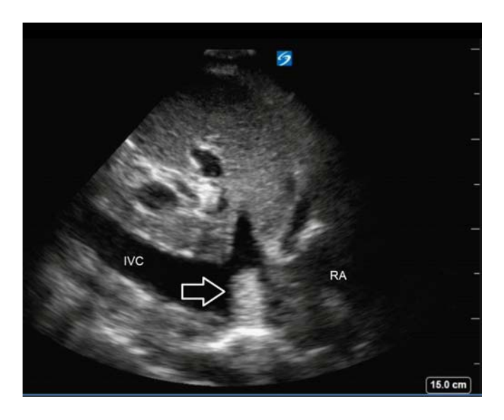
Figure 3. Still image of longitudinal inferior vena cava with arrow pointing to tumor thrombus and inferior vena cava (IVC) and right atrium (RA) labeled.

The echocardiogram shows a large solid echogenic mass in the right atrium. The mass seems to originate from the origin of the inferior vena cava / right atrial junction (Figure 3).