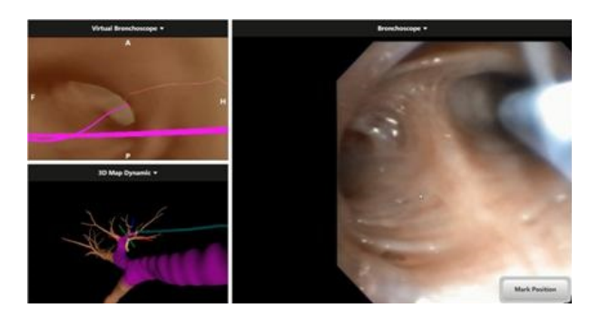
Figure 1. During the first navigation virtual bronchoscope image and 3D map (top left and bottom left) show the tip of the locatable guide in the posterior segment of the right upper lobe matching live video bronchoscope image.